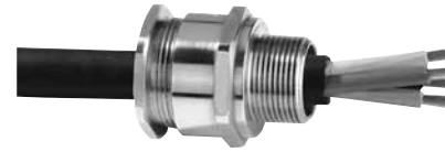
Dimensions in Millimeters (Inches)